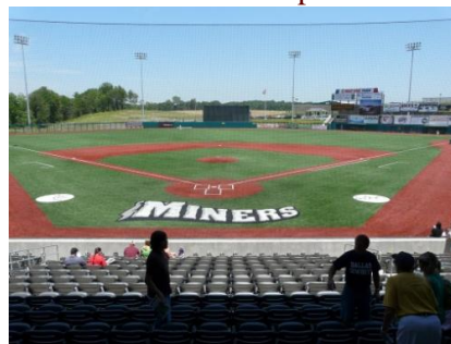
(Rent-One Park, Marion, Il.)

The Porters will carry on their philosophy of playing the very best competition within their non-conference schedule. This season, the Porters will travel to Marion, Illinois to take part in the Miners Showcase Tournament where they will face highly rated teams St. Charles North, Mundelein, Cary Grove and Warren Twp.