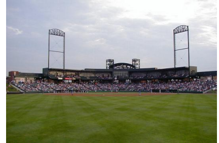
(Silver Cross Field, Joliet, Il.)

When they return from that trip they will begin local tournament play March 30 th at Flink Field in an opening game of the WJOL Tournament vs. arch rival Joliet Catholic. Other top ranked teams the Porters could face in that tourney include Providence Catholic, Minooka, Plainfield South, Lemont and Joliet Twp.