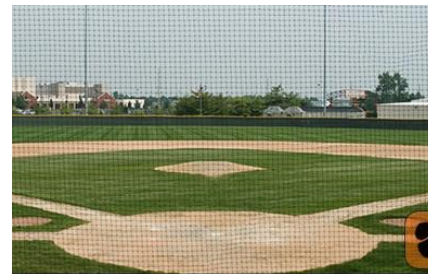
(Edwardsville Tiger Field)

The Porters will play in the Edwardsville Tiger Classic hosted by Edwardsville High School. All four teams in that tournament are recent IHSA State Champions. Included besides the host Tigers and Porters will be Highland, Il. and Chatham-Glenwood.